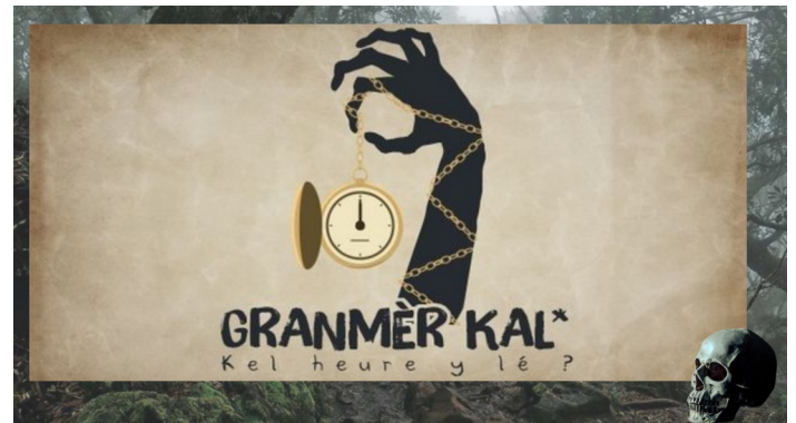
Illustration of the game “What time is it, Old mother Kal?”