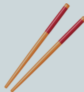
Table manners & chopsticks